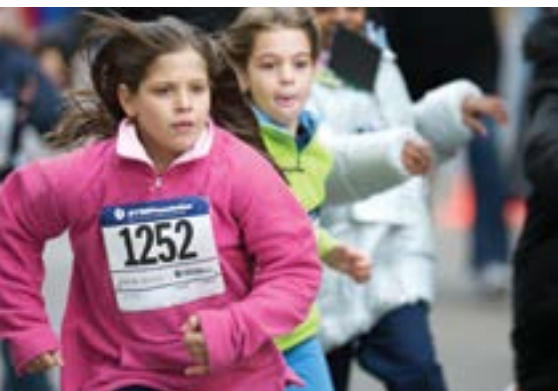
Chart a Course for the Long Run

Help them take the first step towards a lifetime of protection.